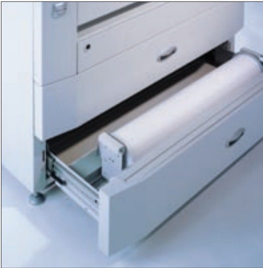
◀ ERGOTEC 1-roll-drawer: On demand, the models RS 4000 and RCS 4000 can be equipped with a 3rd roll – or retro-fitted.