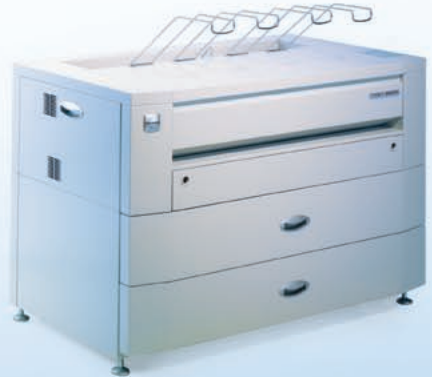
RS 4000 RS 6000 Network Print Systems 600 dpi