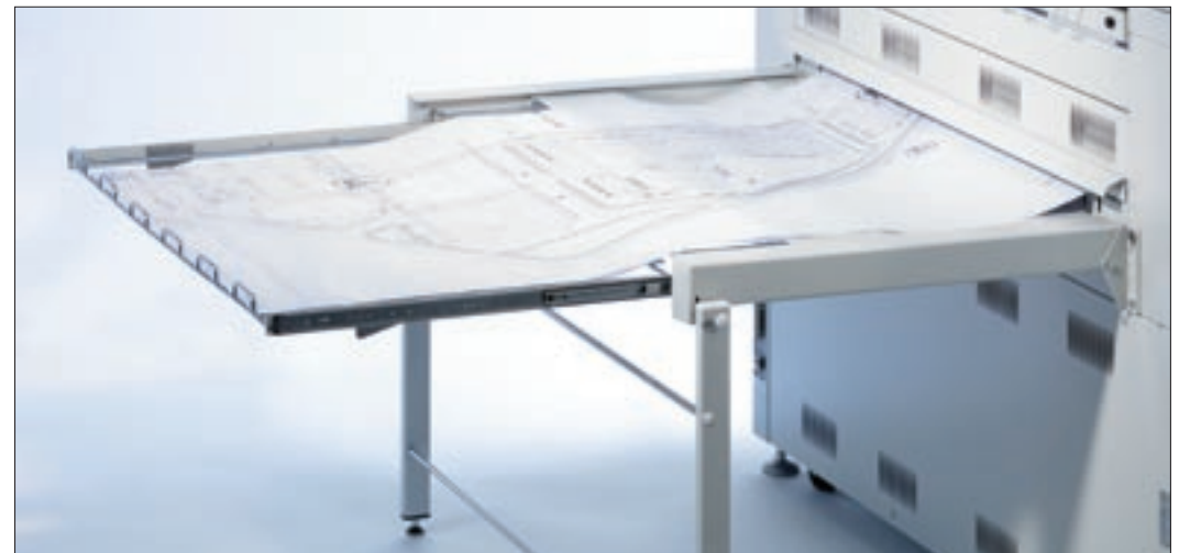
ROWE STACKER is a deposit table for high volumes – no power supply necessary!