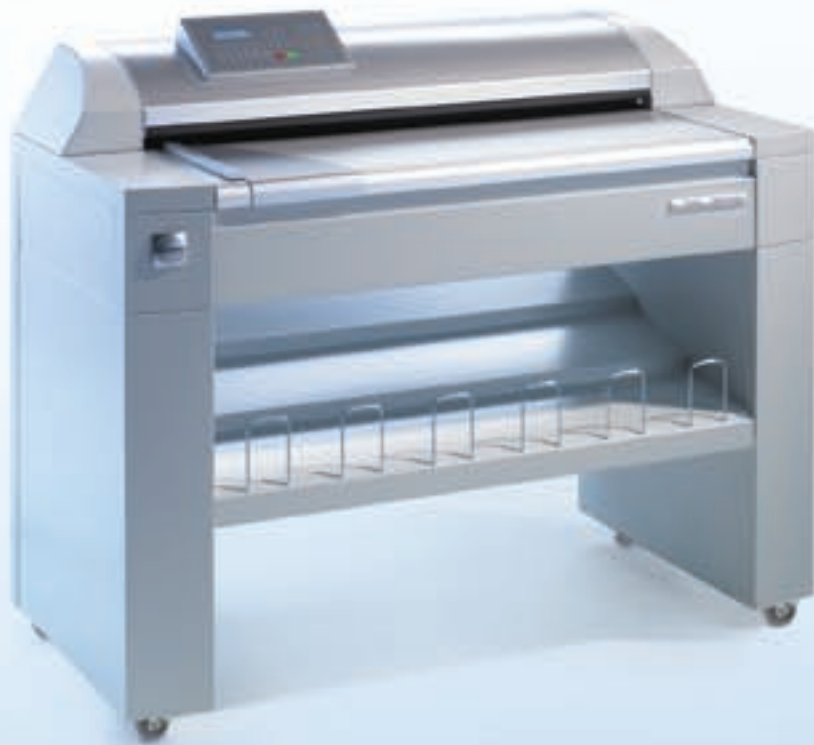
RC 4000 RC 6000 Colour Scan Systems 600 dpi